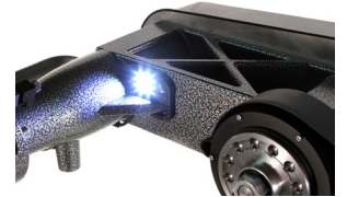
6 LED ON-BOARD WORK LIGHT & LIGHT- WEIGHT "X" BODY